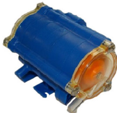
Sensor Port End