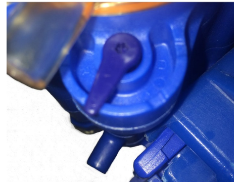
Timing Adjustment Wheel