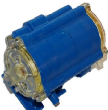
Breather Port End

Shortened rebuild time: Fewer parts and simpler testing procedures results in less time required to rebuild the controller.